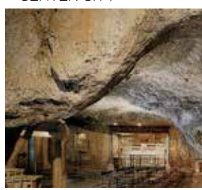
Ancient and modern sanctuaries... Monte Sant'Angelo