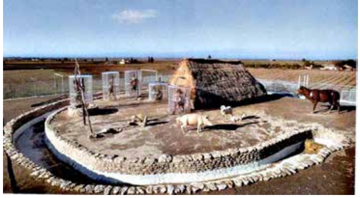
Raven's Pass is one of the typical villages of Tavoliere, dated between 7000 and 5000 years ago (reconstruction).