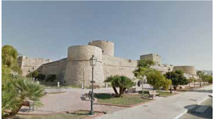
The Manfredonia Castle seen from Corso Manfredi.

Student life is about more than just studying. Not only does the university offer a wide range of activities and projects to make sure you get the most out of university life, but it also offers the beautiful province of Foggia.